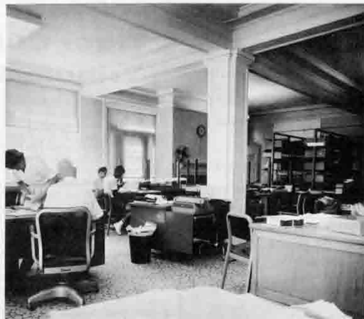
A result of campus expansion, the limited conditions under which the office staff performed this summer.

The construction of the new building which is planned for January will be a continuation of the expansion of the university. By the fall of 1965 officials estimate that two buildings, including a science building and a classroom building, will have been erected for students. The present plan is that the fall of 1965 will be the beginning of the junior year.